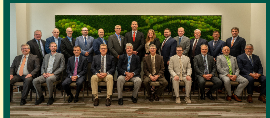
On behalf of Illinois Soybean Association (ISA), which includes both the Illinois Soybean Board (ISB) checkoff funded program, and the Illinois Soybean Growers (ISG) non-checkoff member program.